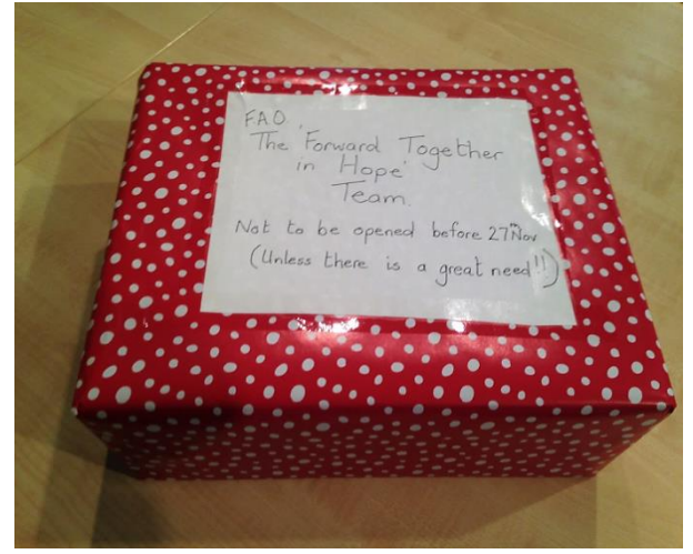
One particular family in the diocese sent a 'Secret Weapon' to the Forward Together in Hope team. The parcel was not to be opened until Sunday 27<sup>th</sup> 'unless there was great need'. It contained a variety of packets of biscuits, some chocolate (70% cocoa – very healthy) and a stress ball. This was to help the team and other colleagues to cope with all the stress of checking and collating all the responses. Needless to say, everything has now been consumed - well, apart from the stress ball!

We must offer huge thanks and congratulations to everyone involved in preparing, producing and sending the local 'Our Partnership Proposals'. By 12:00 noon on Sunday 27th November, every single parish in the diocese was included - a 100% success rate. That is a truly fantastic response and is a great credit to all our parishioners and clergy. I doubt if there has ever been such a thorough reply to a request in the history of the diocese! It is humbling to read how so many of our parishes are looking ahead to the future. Many fully appreciate that there will be changes, that there will be fewer celebrations on Sundays. But many are really open and looking beyond their own parish to explore new ways of serving others, worshipping and witnessing to Jesus in the future.